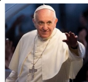
POPE FRANCIS Fratelli Tutti

THE PARISH OFFICE IS CLOSED until further notice due to level 5 restrictions. We can be contacted by telephone Monday to Friday from 9.30am to 12.30pm or by email at office@stjohns.ie